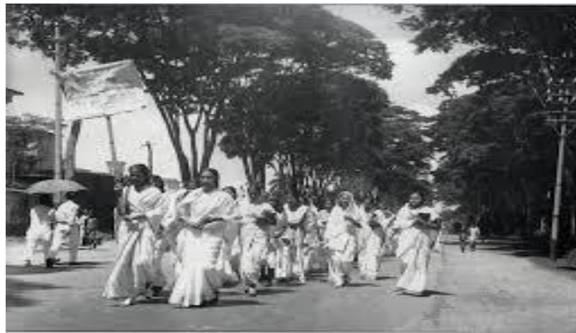
Procession of the students of Dhaka University