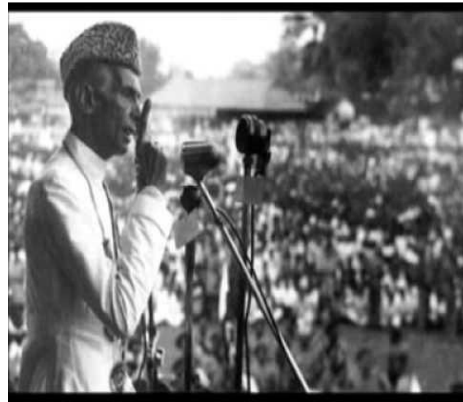
Mohammad Ali Zinnah (21 March 1948)