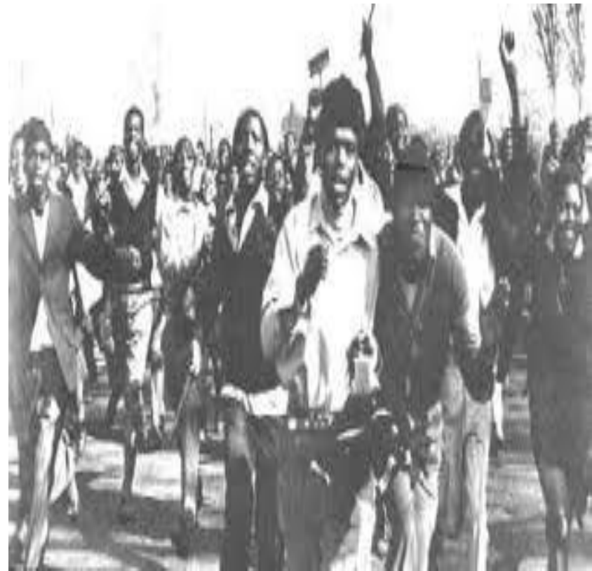
Protest of the students