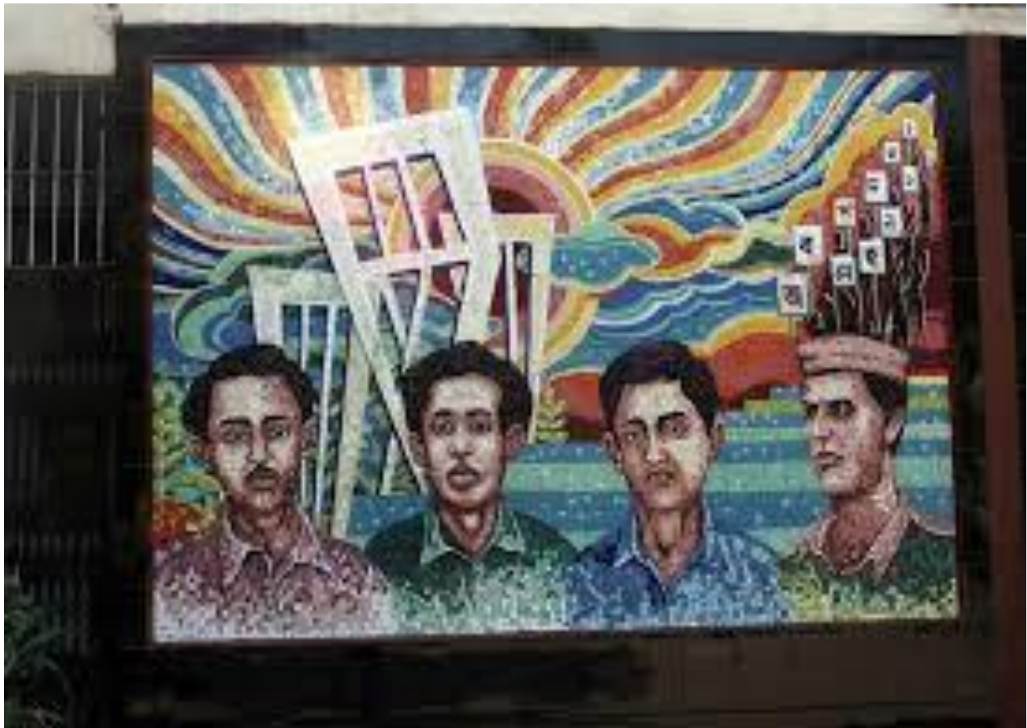
Martyrs of Language Movement